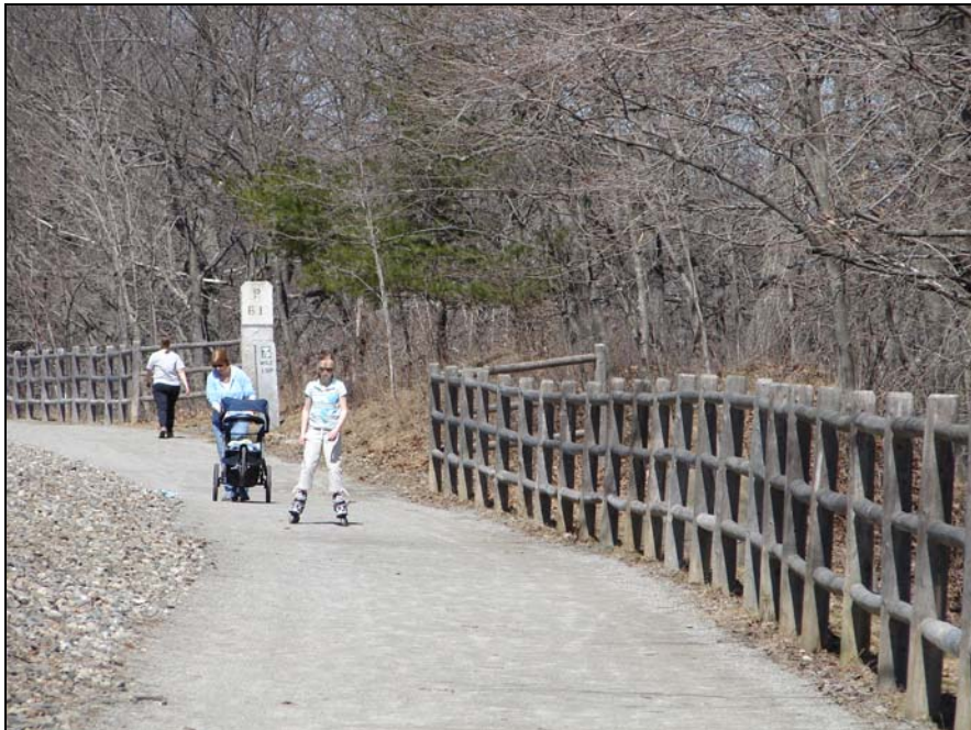
Photo 1-4: Kennebec Rail Trail Promotes Health of All Ages Holly Dominie

Fortunately, Hallowell’s existing settlement pattern promotes walking and enjoyment of the outdoors, and many people take advantage. We have something very good going on here. This plan is about sustaining what we have and creating more inviting, safe open spaces and pathways for healthy outdoor activities like walking, running, cycling, skateboarding, pick-up games, skating, and cross-country skiing.